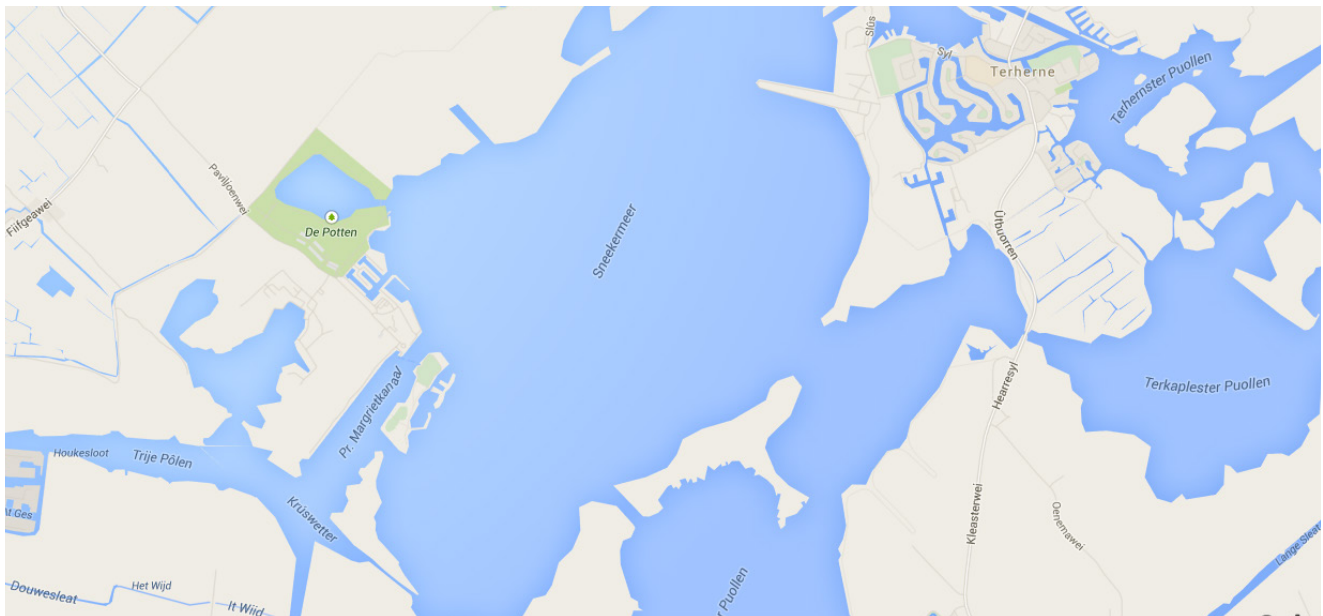
Sneekermeer, Friesland, The Netherlands